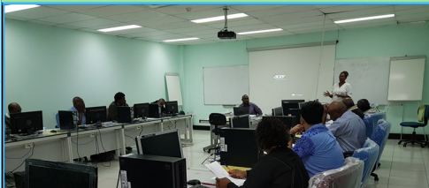
PCaB Advisors during the training at IFMS training room.

It was seen as a very important week for the PCaB’s Site Advisers to attend a week’s IFMS Training on few of the modules which are recently conducted by IFMS Training Section. IFMS is the National Government’s Program through Department of Finance which integrates whole of Government Systems.