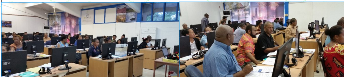
The pictures below shows participants for Central Province going through the IFMS training.

The IFMS training covered the following introductory and business processes: (IFMS) Concepts,, System navigation, Procurement, Accounts Payable, Receipting and part of Budget Execution.